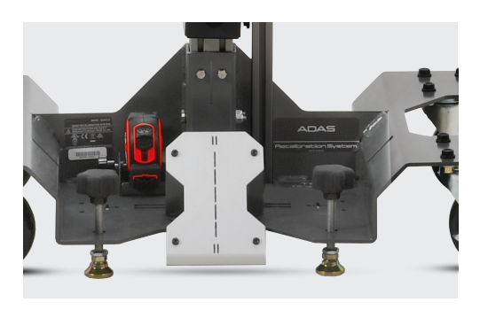
PATENT-PENDING TARGET POSITIONING

Laser-guided positioning for a fast and accurate target placement.