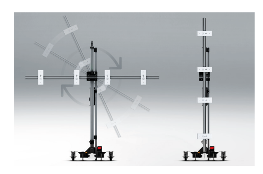
FOLD-UP AND ROLL AWAY

Easy centerline setup using mirror stand for accurate positioning.